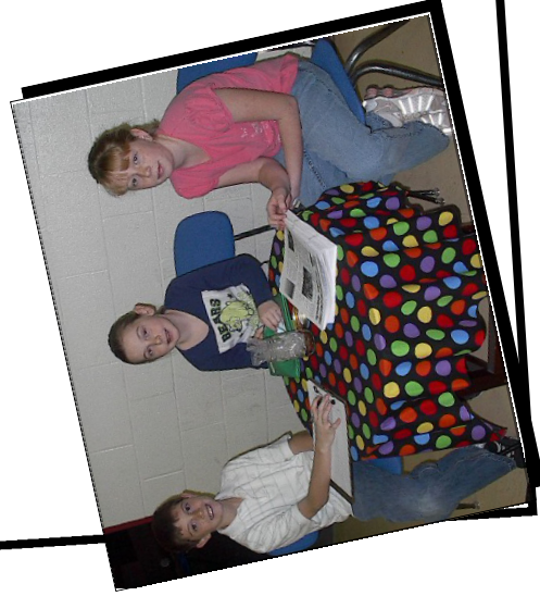
Staff members of Tomahawk Intermediate's 2006-07 Smoke Signals are selling their school newspaper.

Participating schools will receive a reproducible student guide and additional resources throughout the year, as well as the distinction of being a part of a unique network of classrooms working to make writing an authentic experience.